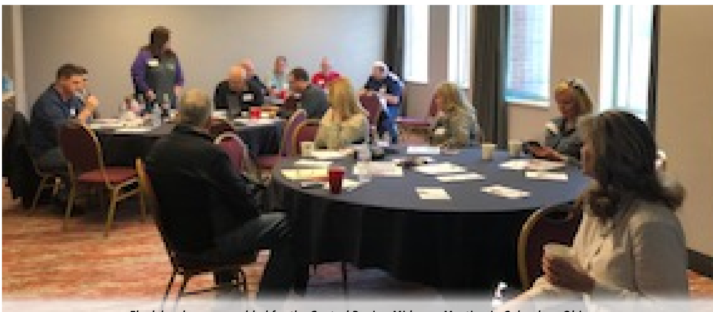
Flock has been assembled for the Central Region Mid-year Meeting in Columbus, Ohio