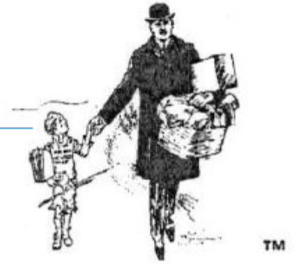
"The Boy He Used To Be" TM

"The Shoe Program is just one of many such programs. This exemplary program provides shoes for children who cannot afford proper footwear. These children are identified through the Attendance and Administrative Offices in the school districts with which we work. They are then presented with vouchers for a complimentary pair of shoes at any Detroit area Mr. Alan's store. Mr. Alan's fits the child with the right pair of shoes and then turns the costs over to the Goodfellows."